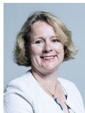
Vicky Ford, MP