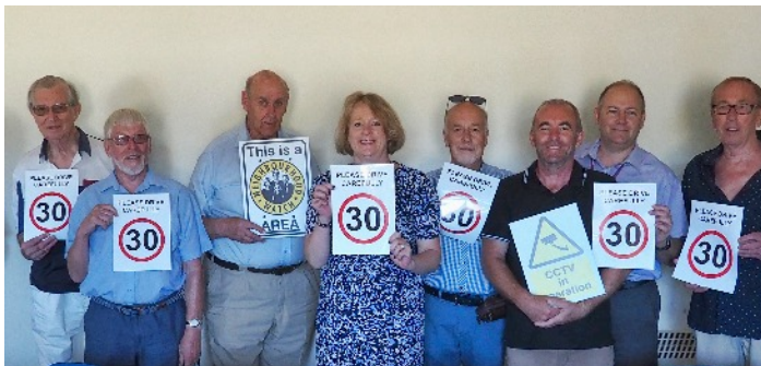
Vicky Ford, MP, with some local Neighbourhood Watch and City Council representatives at the Chelmsford Group's AGM in July.